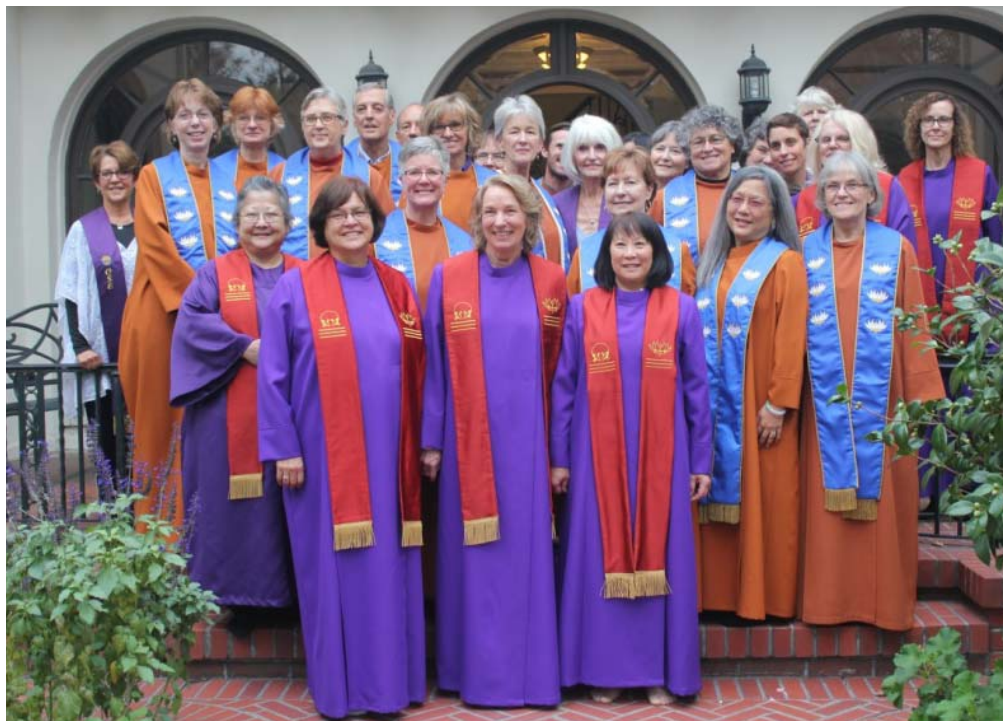
CSE MINISTERS AND INTERNS