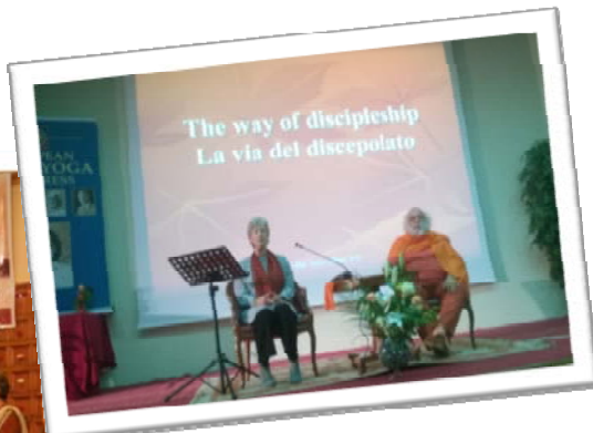
1st European Kriya Congress in Milan, Italy (left); Swami Vivekananda's 150th Birth Anniversary concluding program, sponsored by Berkeley Vedanta Center (far left); Eternal Way Yoga & Meditation Retreat at Unity Village, MO; Sambodh Ashram in Kalamazoo, MI; Oakland Prayer Symposium at East Bay Church of Religious Science; Here After Here community program on spiritually conscious living and dying.